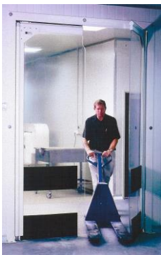
① & ②